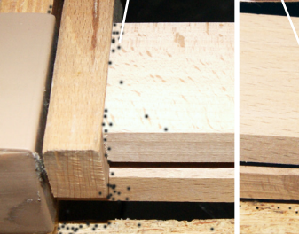
Traces of faeces